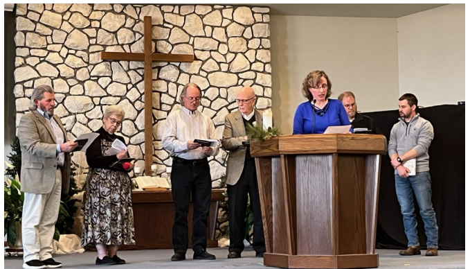
Commissioning our leaders